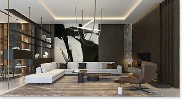
Fabulous off plan villa on the beachside area in Guadalmina golf

Location: Marbella Price: From 3,290,000 €